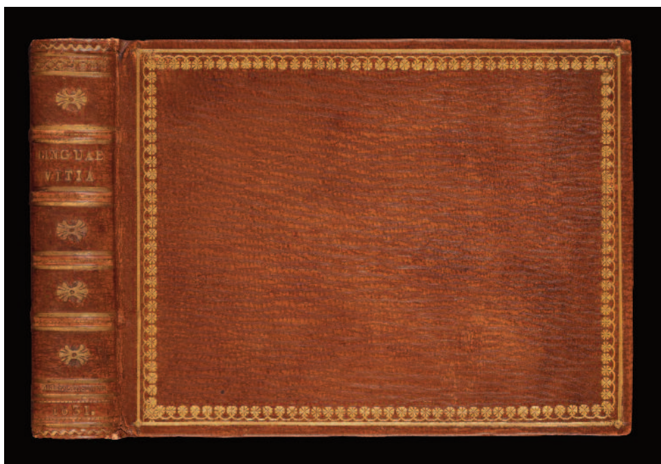
Admonitory and exhortatory. No. 14.

Gilt straight-grained brown morocco (Simier), rule and flower frames, spine, title and board edges gilt, three sets of endleaves — vellum and marbled paper and plain paper, all edges gilt, red silk marker.