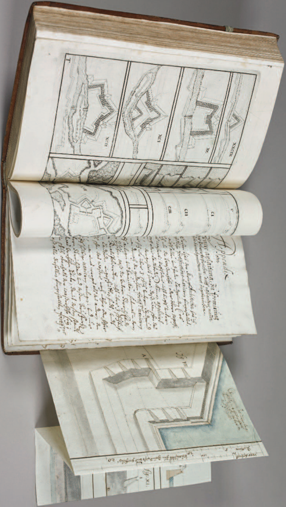
Rocks and paper. No scissors, please. No. 29.