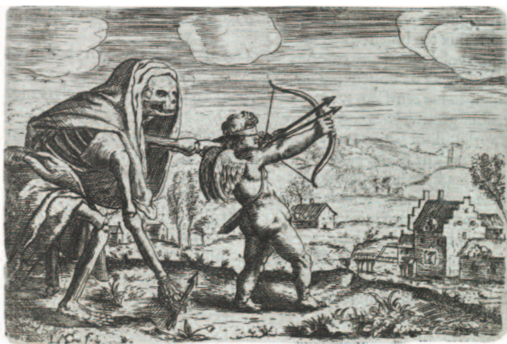
Not getting lucky tonight. No. 15.