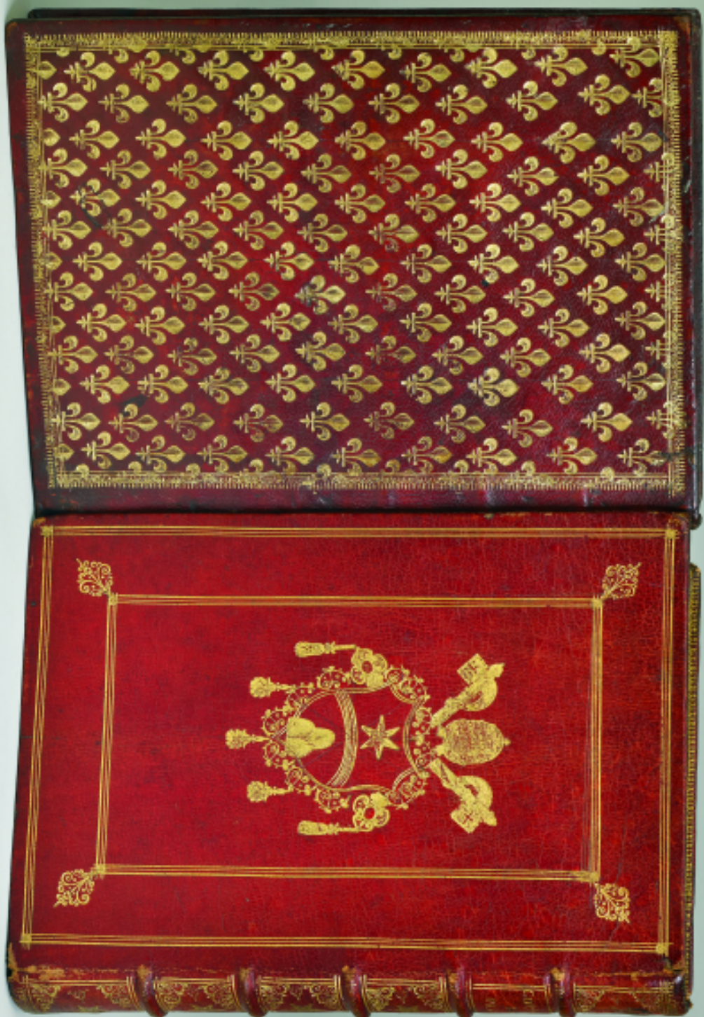
Guides to insides. Nos. 29 & 70.