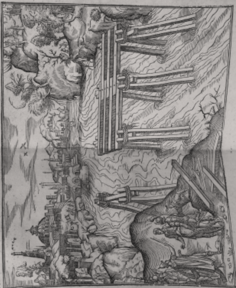
Siege warfare, material strengths & Tartaglia's principles. No. 16.