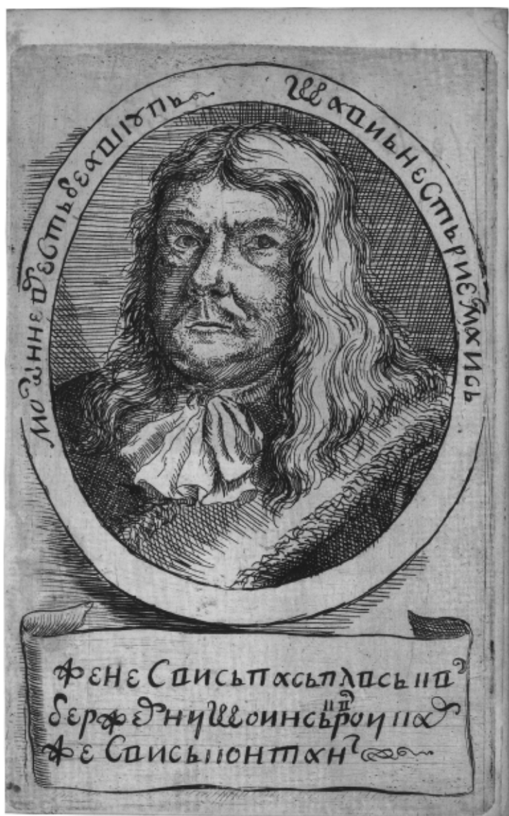
The Exterminator. No. 42.