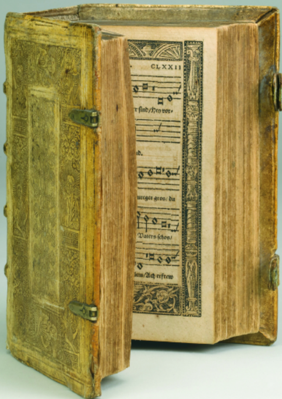
It put the Reformation in the Counter-Reformation. No. 46.